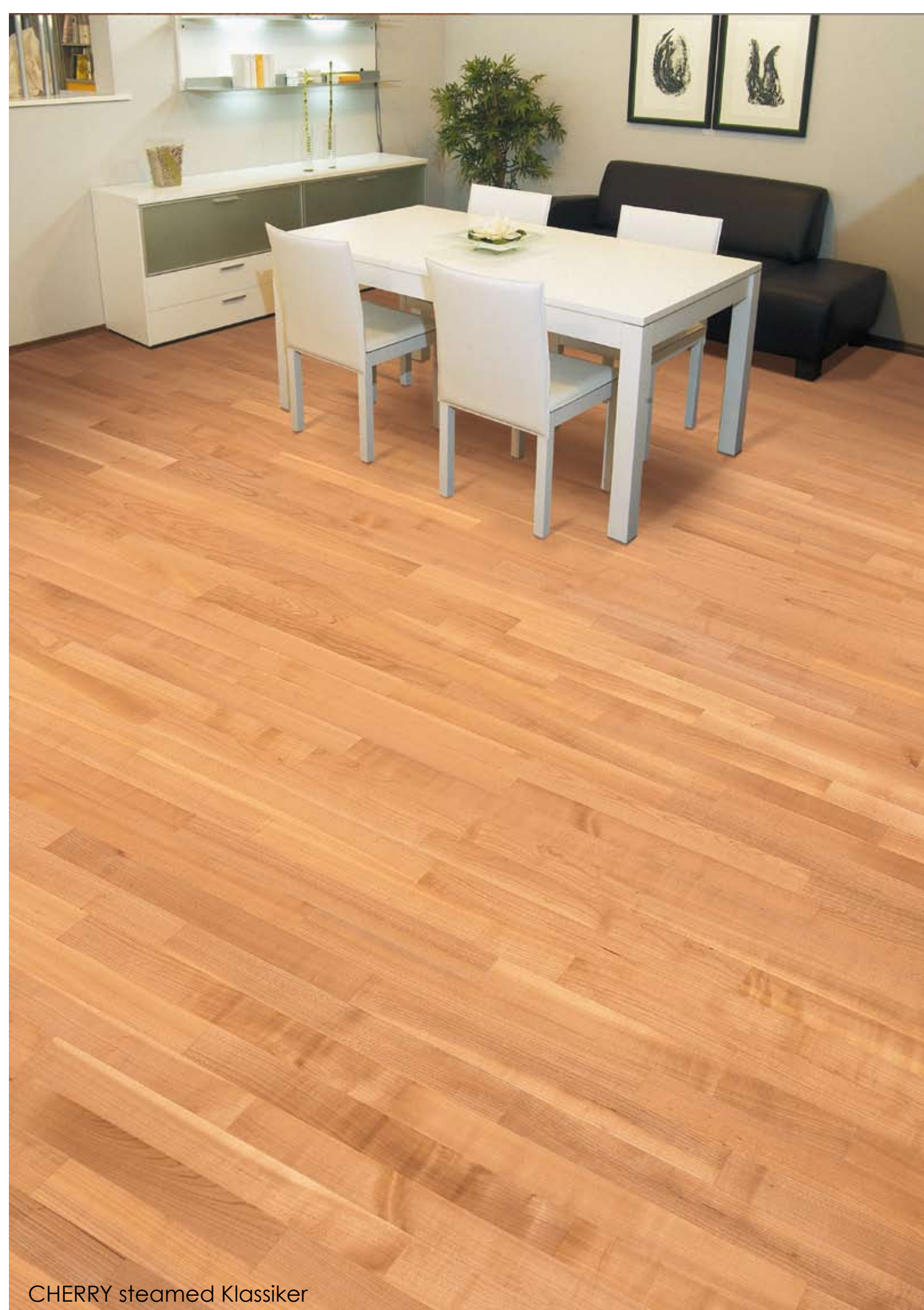
CHERRY steamed Klassiker

Symbol picture - can vary in colour and structure