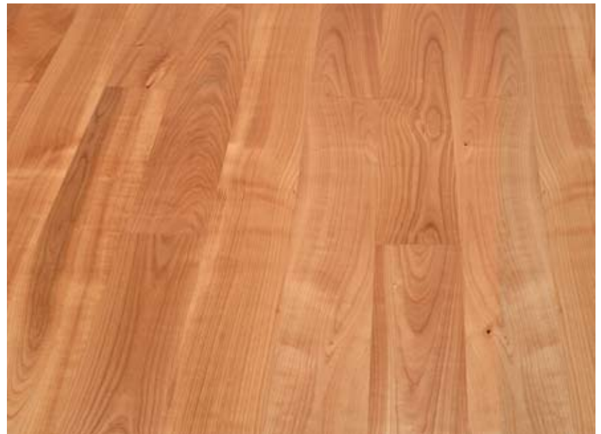
Symbol picture - can vary in colour and structure