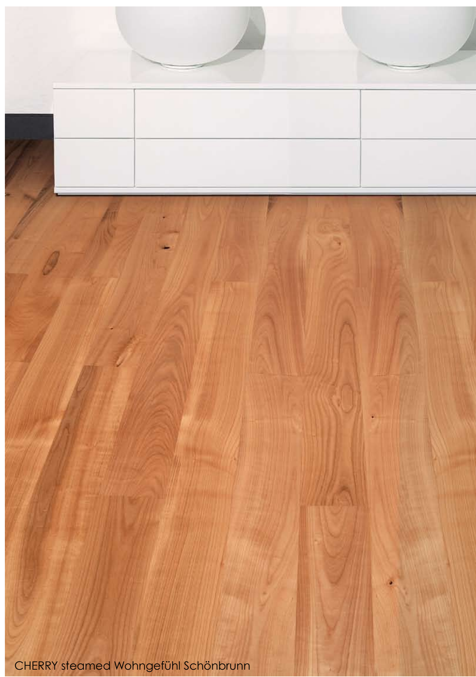
CHERRY steamed Wohngefühl Schönbrunn